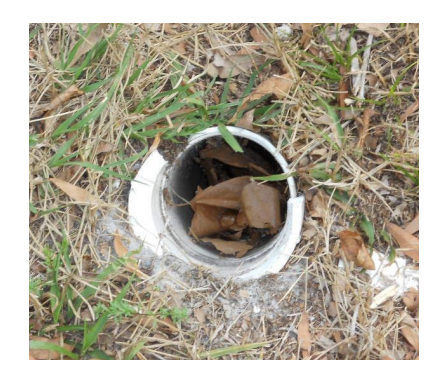
Clean Out Cap is Missing