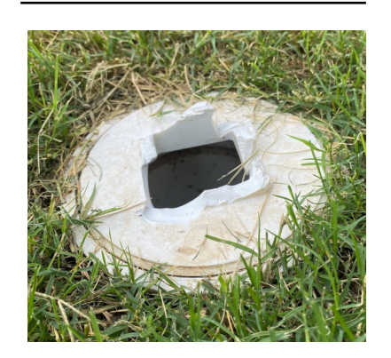
Clean Out Cap is Broken