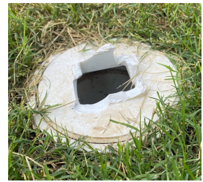
Clean Out Cap is Broken