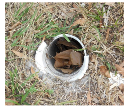
Clean Out Cap is Missing