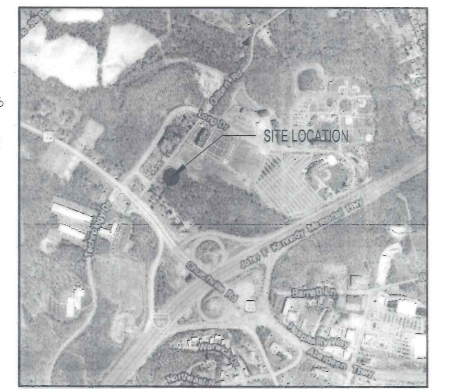
VICINITY MAP SCALE: 1"=2000' ADC MAP 44 GRID D-6