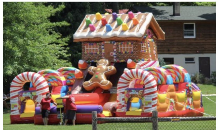
Candyland Obstacle Course