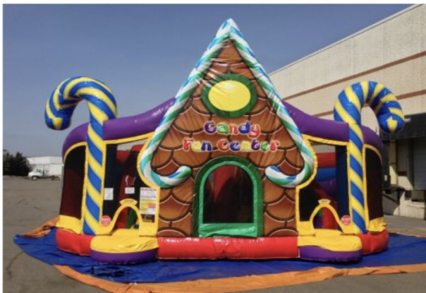
Candyland Fun Center