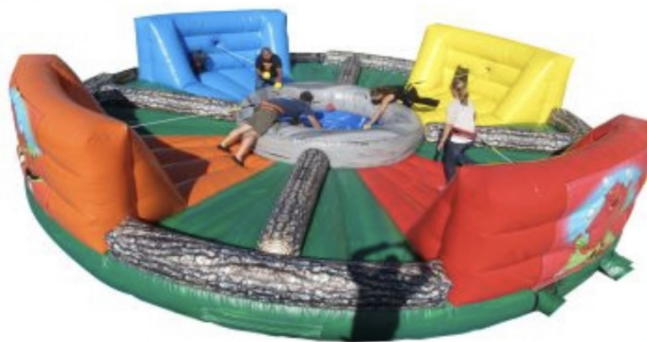
Hungry Hippo Challenge

Wristbands Required for all amusements $10.00 each (no replacements wristbands, and no refunds) We do have an inclement weather date schedule in June 2023.