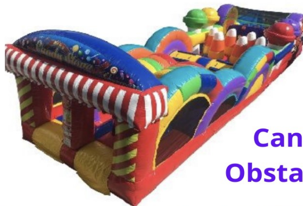
Candy Store Obstacle Course